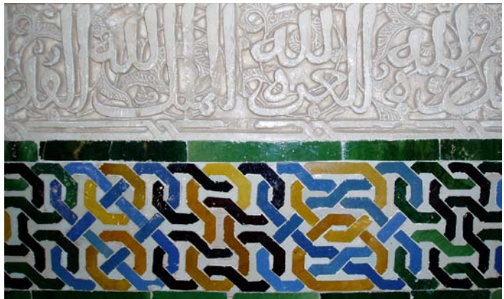
Decoration on the walls of the Alhambra