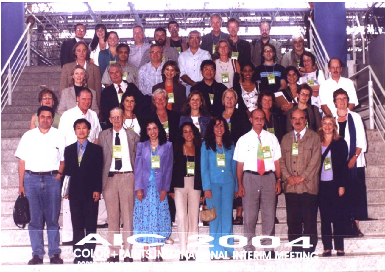
Delegates at AIC 2004 Color and Paints – Porto Alegre, Brazil