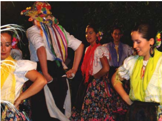
Entertainment at the Andalusian Dinner