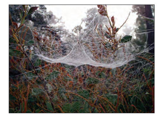
Figure 20 Spiders web with dew; transparency made visible by contamination with moisture and reflections on the moisture