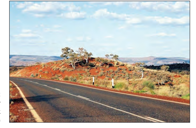
Figure 19 Scale and distance blur colour; foreground and mid ground are highly chromatic, brighter and or darker than the back ground beginning to fade to greys (Pilbarra)

Figure 18 Transition from colourfulness to lightness, with unexpected glare on the green leaves