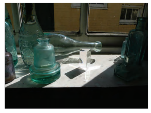
Figure 12 Old bottles and transparent prism illustrate shadows and reflections of transparent subjects