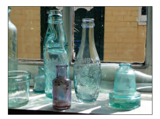
Figure 21 Transparency as contaminated by colour behind it; greater chromatic colour appears in bends and double layers