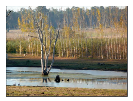
Figure 5 Acute phase, after mid-afternoon; late autumn, afternoon shadow and light in balance, sunlight between 15 and 30 degrees (Manjimup)

2.2 The exquisite and acute phases occur when the sun is between approx. 15 and 30 degrees, respectively, to the landscape: prior to mid-morning is the exquisite phase (Figure 4) and after mid-afternoon is the acute phase (Figure 5).