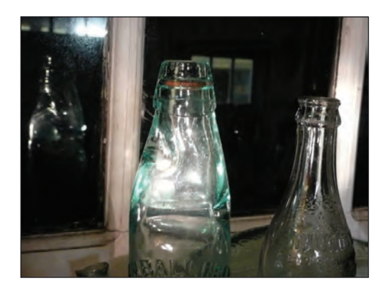
Figure 22 Bottles and glare; strong focused light creates an appearance of translucence/near opacity of surface by whitish (glare) reflections on transparent surfaces