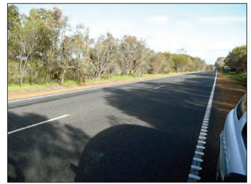
Figure 11 Impacted glare and shadow on road

Note, the reputed 'dreariness' of West Australian Jarrah forest may be a 'greyness' caused by the whitish effect of glare on waxed and reflective eucalypt leaves viewed from a distance, while a walk through a Jarrah forest discloses the beauty of translucent greens as light is seen through leaves.