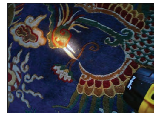
Figure 10 Impacted whitishness of torchlight on carpet; light enhances colour but when too strongly focused light overwhelms colour as whitish