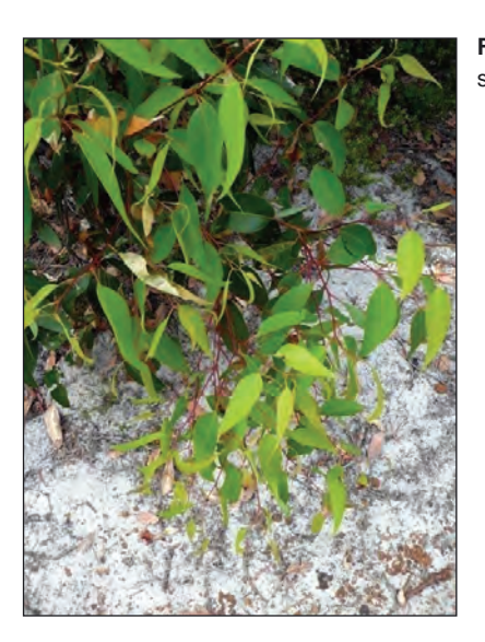
Figure 14 Colour appears more chromatic on grey days with less shadow and flatter form