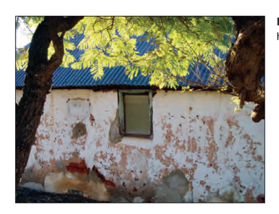
Figure 4 Exquisite phase, prior to mid-morning; a couple of hours after sunrise (New Norcia)