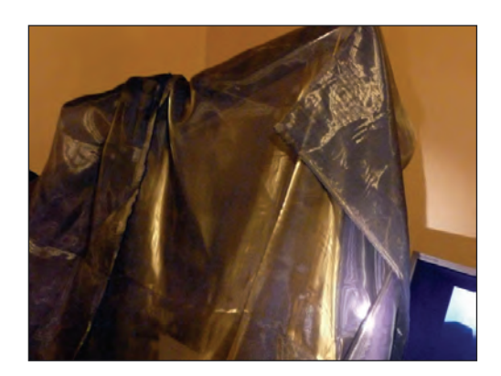
Figure 24 Transparent metallic cloth with a light shining directly onto it from the same angle it is viewed from is now reflective (metallic) and opaque