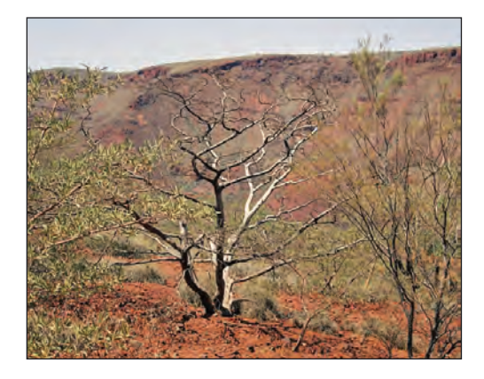
Figure 7 Midday phase; increased shadow depth , reduced shadow extent, whitish colour (Pilbarra)