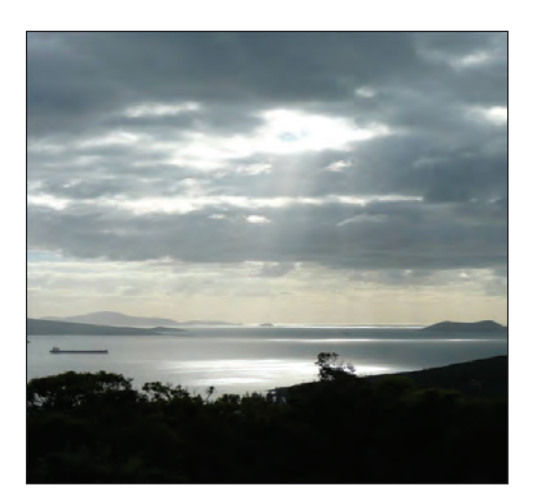
Figure 1 Glare and abysmal dark (King George's Sound, Albany)

2.1 Around dawn and dusk when the sun is just below the surface or less than approx. 15 degrees above the surface, light may be more coloured (yellows/reds) than at other times, there are far reaching shadows and tonal contrast is shallow, and there is a tendency to silhouettes (zone of silhouettes) and patches of translucent colour where elements such as leaves or grasses catch light and light is reflected as white mist and multiple colour in dew, rain drops and cobwebs; soft glare (whitish) may occur (Figure 2 and Figure 3).