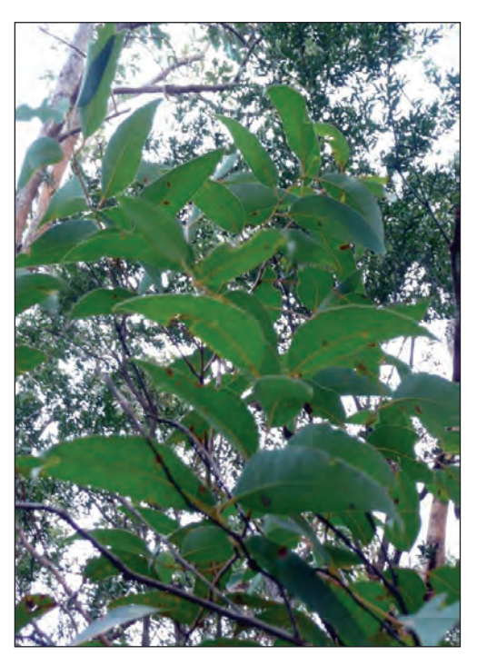
Figure 9 Grey day translucent leaves with reduced shadow