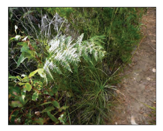
Figure 18 Transition from colourfulness to lightness, with unexpected glare on the green leaves