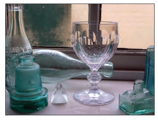
Figure 13 Old bottles and prism on a grey day; high chromaticity, shadows are almost non-existent, reflected whitish glare factor remains