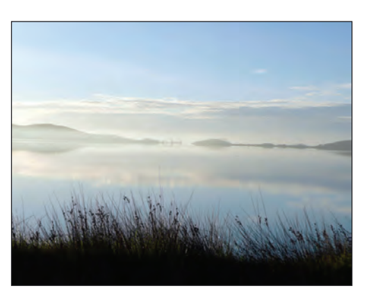
Figure 2 Dawn with silhouettes (Princess Royal Harbour, Albany)