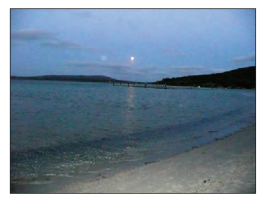
Figure 3 Dusk (Oyster Harbour, Albany)