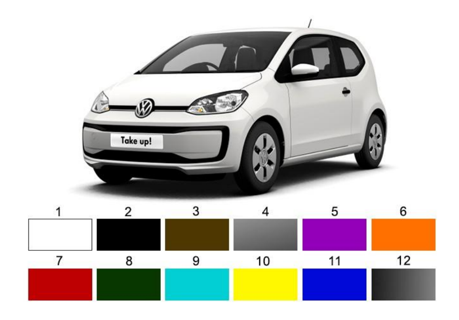
Figure 6: Example from an online survey Car class and offered colors.