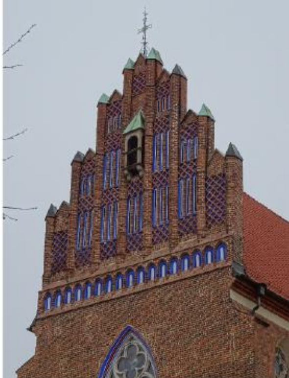
Figure 5: The Corpus Christi church, Wrocław. The medieval gable was painted in the 1920s (left). By Schlesischer Malerbund, 1928, vol. 11, 367-369. The detected colour scheme was restored a few years ago (right).

A conservator who examined the market hall in Dzierżoniów detected a colour scheme applied during the refurbishment around 1940. Old plaster was removed and the market hall and cloth hall were replastered and painted yellow ochre in two shades, the walls and windowsills were painted lighter shade and the window surrounds and cornices a darker shade.