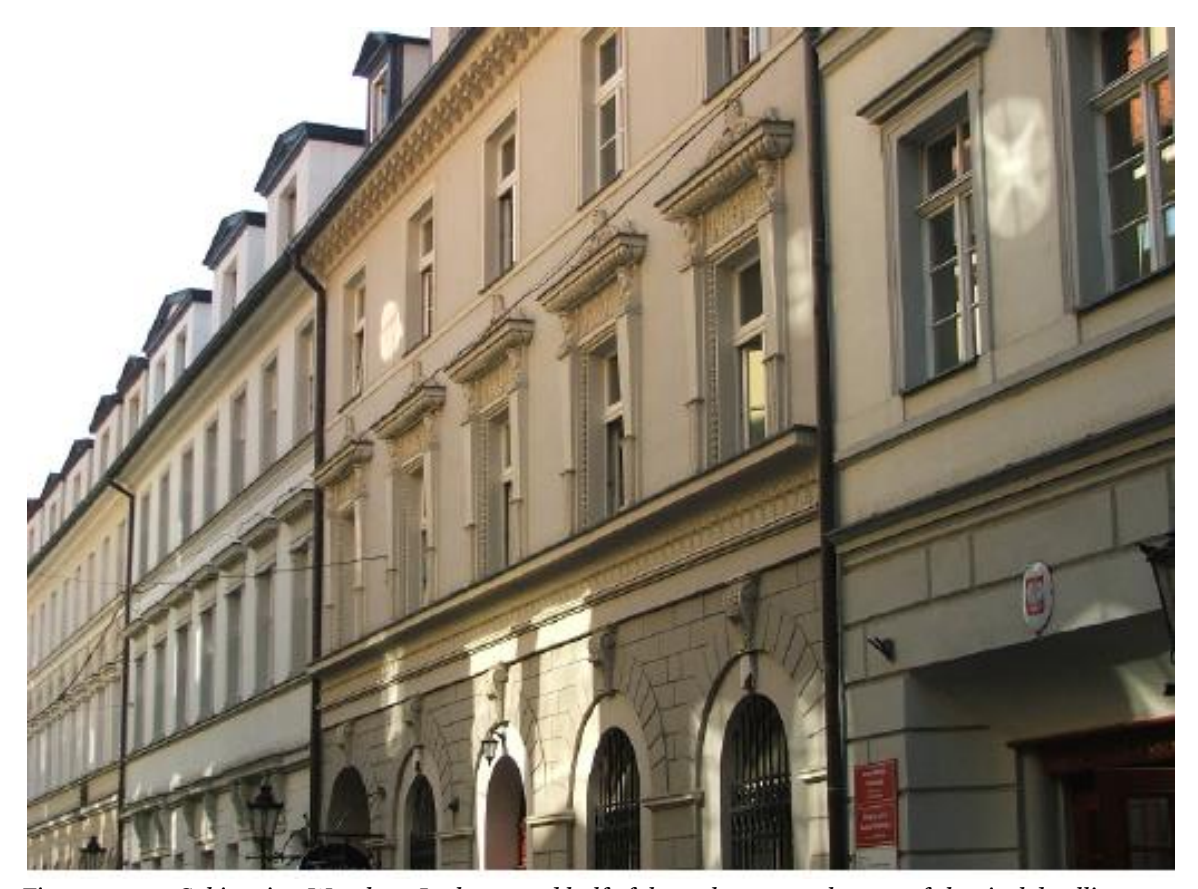
Figure 4: 9-13 Sukiennice, Wroclaw. In the second half of the 19th century the row of classical dwellings was repainted in various hues: beige, brown, cream, pink, yellow ochre.

Examinations of the Wroclaw dwellings at 9, 10, 11, 12, 13 Sukiennice, erected in the years 1821-24, revealed the colour schemes used in the second half of the 19th century. At that time, the buildings were painted the following way: yellow (dwelling number 9), beige (number 10), yellow ochre and pink on the walls and cream, pink and white on details (number 11), brown on the walls and yellow ochre / pink on the architectural details (number 12), sandy/ brown (number 13). The dwellings at number 11 and 12 had lighter architectural details, otherwise the buildings were painted uniformly (see Figure 4).