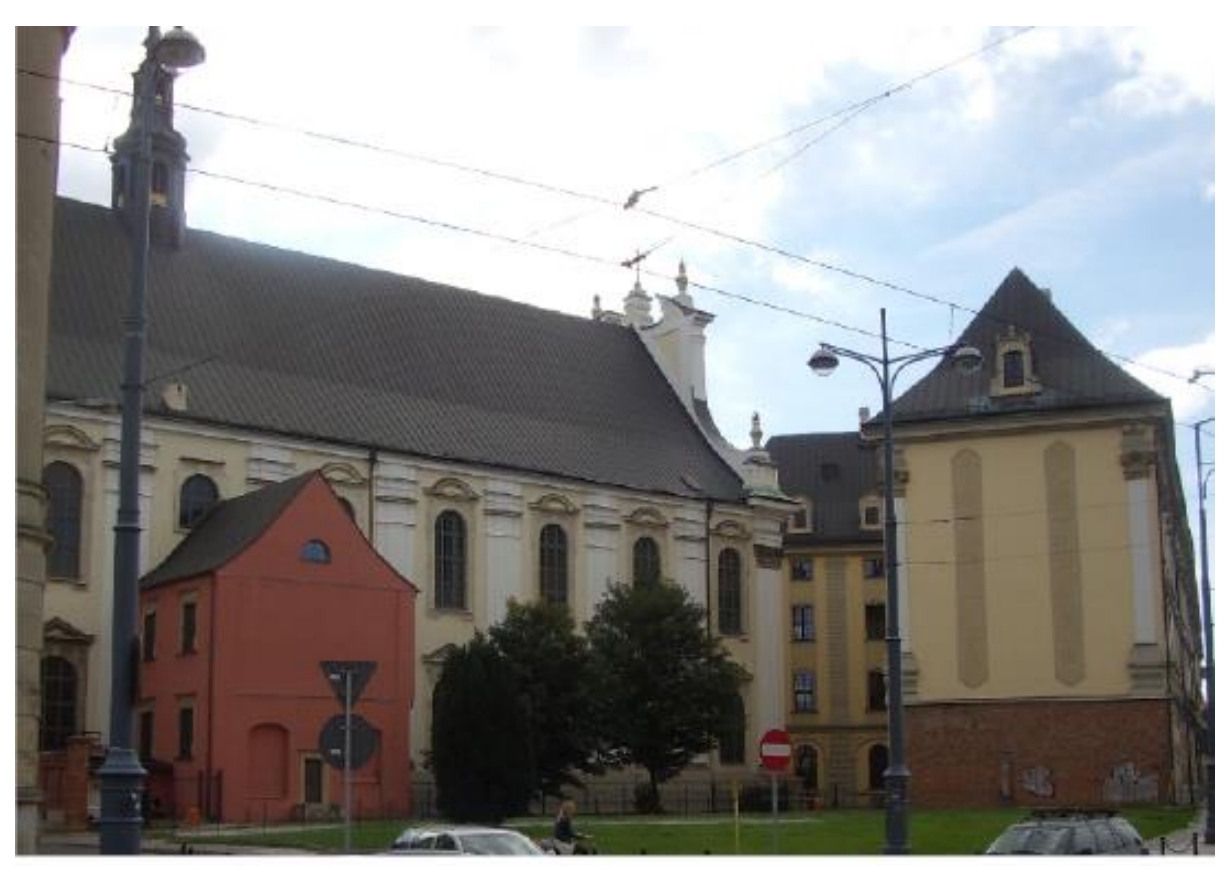
Figure 2: Ulica Grodzka, Wrocław. The Renaissance remains of the royal castle were painted red during the recent refurbishment, a hue linked to the refurbishment at the turn of the 19th and 20th centuries (Photo by the author, 2012).