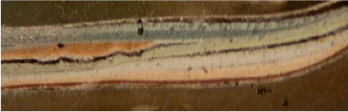
Figure 6: The difference in visibility of the sequence of plaster and paint layers on site and under the microscope.