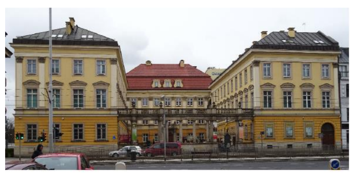
Figure 3: The former palace at 34-35 ulica Kazimierza Wielkiego, Wrocław. In the mid-19th century the wings were added and the whole palace was repainted reddish pink (Photo by the author, 2016).

In Kliczków, a medieval castle was rebuilt in the Renaissance style and enlarged in the years 1881-83. It was estimated that beige was applied to the palace elevations during the 19<sup>th</sup>-century refurbishment, with the exception of stone parts that were left uncoated.