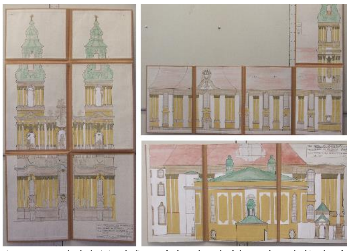
Figure 11: An example of a depiction of a discovered colour scheme that helps to understand achieved results and avoid wrong or unclear conclusions. Reconstruction drawing of the original colour scheme of the former Cistercian church and the mausoleum in Krzeszów. Drawings by Anna Dorak.

Generally speaking, documents aim to record the work for future references. The examined records varied form a single sheet of paper to a heavy report with tiny samples added to the documentation. A letter in a form of a single sheet of paper usually informed that examinations were conducted and provided information on colours of the first chronological phase without any explanation in what way the examinations were conducted. Most of the examined documents consisted of several pages and provided information on the goal of paint research, scope of the work, and colours that were detected. Some of reports provide a brief history of a building and discussed methodology of examinations including pictures taken on site, under the microscope and in the chemical laboratory. Some of the analysed reports included depictions of reconstructed colour schemes that additionally explained the intensions of the author of a record and helped to avoid confusion in case some information was missing in the text (see Figure 11).