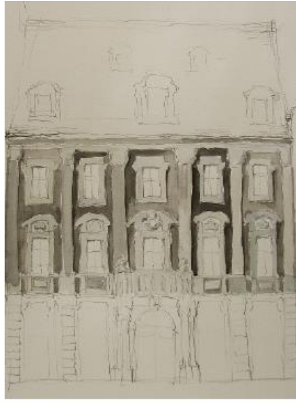
Figure 10: 6 Rynek, Wroclaw. The building has been rebuilt and redecorated a few times since the Middle Ages. The second examinations revealed traces of colour schemes: red-pink paint (1st phase) and light yellow ochre (2nd phase), both possibly from the period before the Baroque refurbishment. The dark grey and grey colour scheme was discovered directly on the Baroque window surrounds (Photo and sketch by the author, 2013).