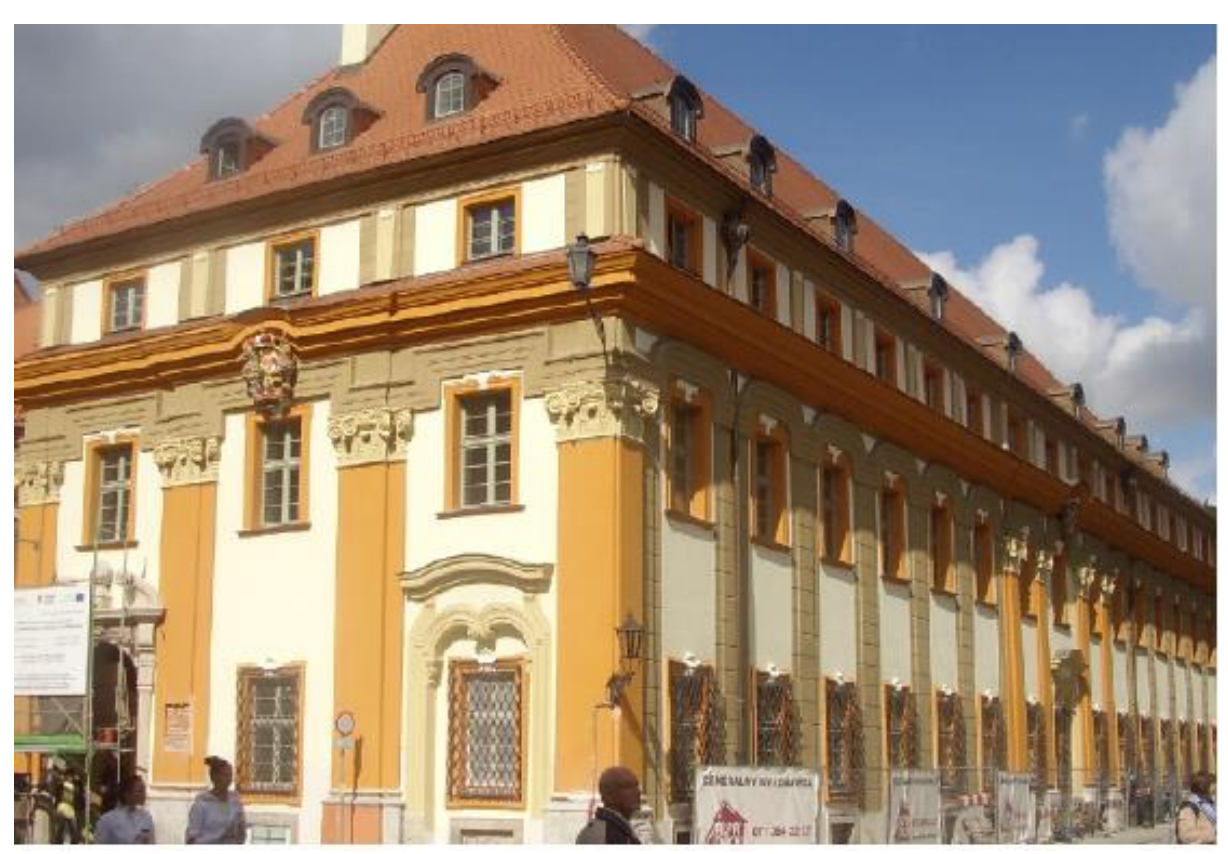
Figure 9: The former orphanage at 4 ulica Katedralna, Wrocław was restored to one of two colour schemes suggested by a conservator who made an on-site examination.

It was also confusing when a conservator who conducted paint research provided a few possible colour schemes described as from the first chronological phase. For example, the former orphanage located at 4 ulica Katedralna in Wroclaw was examined in situ. A conservator who examined the Baroque building supposed that the north elevation was originally two-coloured: light yellow was applied to the walls and yellow ochre — orange to the architectural details. The conservator also presumed that the east elevation was originally three-coloured: yellow, orange and brown. According to the conservator, both versions could have been original colour schemes as they were similar; however, it was not clearly stated if the elevations were painted differently at the same time, or if both versions were possible, but only one of them was applied to the elevations (see Figure 9).