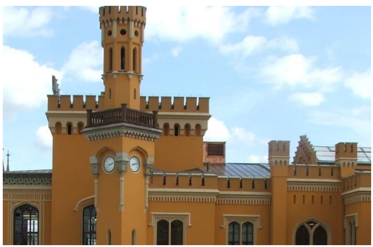
Figure 8: The railway station Wroclaw Glówny - detail. The elevations were partially restored to the original colour scheme form the mid-19th century. The colour scheme was possible to detect due to the full access to the building.

Examinations of the main railway station building were conducted by two different conservators, the first one prior the refurbishment and the other one - during the refurbishment. The first conservator had limited access to the building and the other conservator conducted examinations with full access during the refurbishment. As a result, the first conservator assumed that the building was probably originally painted light beige/ sandy hue. However, due to the better access to the building the other conservator established that the light yellow ochre was in fact the second chronological phase, and that the building was originally painted monochromatically intense yellow ochre-orange, with the exception of the stone parts exposed without painting. The window frames were painted dark brown (see Figure 8).