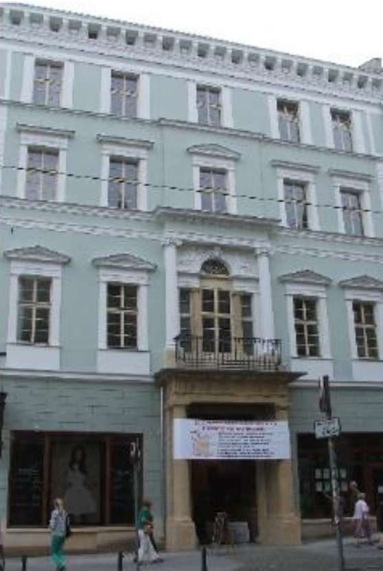
Figure 7: 16 ulica Wita Stwosza, Wrocław. Yellow ochre was estimated as the original colour by on-site observations (left). Re-examinations with the analysis of selected samples under the microscope revealed that the building was originally painted monochromatically grey-green. The grey-green layer of paint was visible beneath yellow ochre under the microscope.