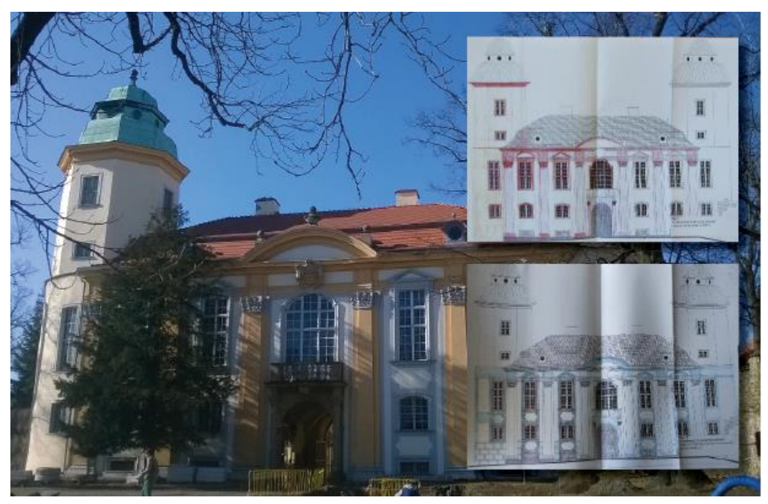
Figure 1: The gate house of the Książ estate in Wałbrzych. The building today (photo by the author, 2014). Sketches of the detected Baroque colour schemes: (upper drawing) colour scheme from the first phase, (lower drawing) colour scheme form the second phase. Photo by the author, sketches by Elżbieta Grabarczyk.

Tiny remains of ornate wall painting on the third floor's pilasters were detected on a dwelling at 25 Rynek, Świdnica. That decoration was linked to the late Baroque refurbishment in the second half of the 18<sup>th</sup> century.